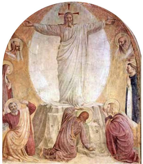
Transfiguration, by Bl. Fra Angelico.

The good news is that Jesus died on the Cross to save us from sin. He invites us to love Him and accept His gift of salvation.