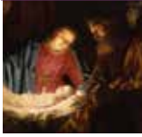
Adoration of the Shepherds by Gerard van Honthorst (1592–1656)

Directions: Take some time to quietly view and reflect on the painting. Then discuss the questions below.