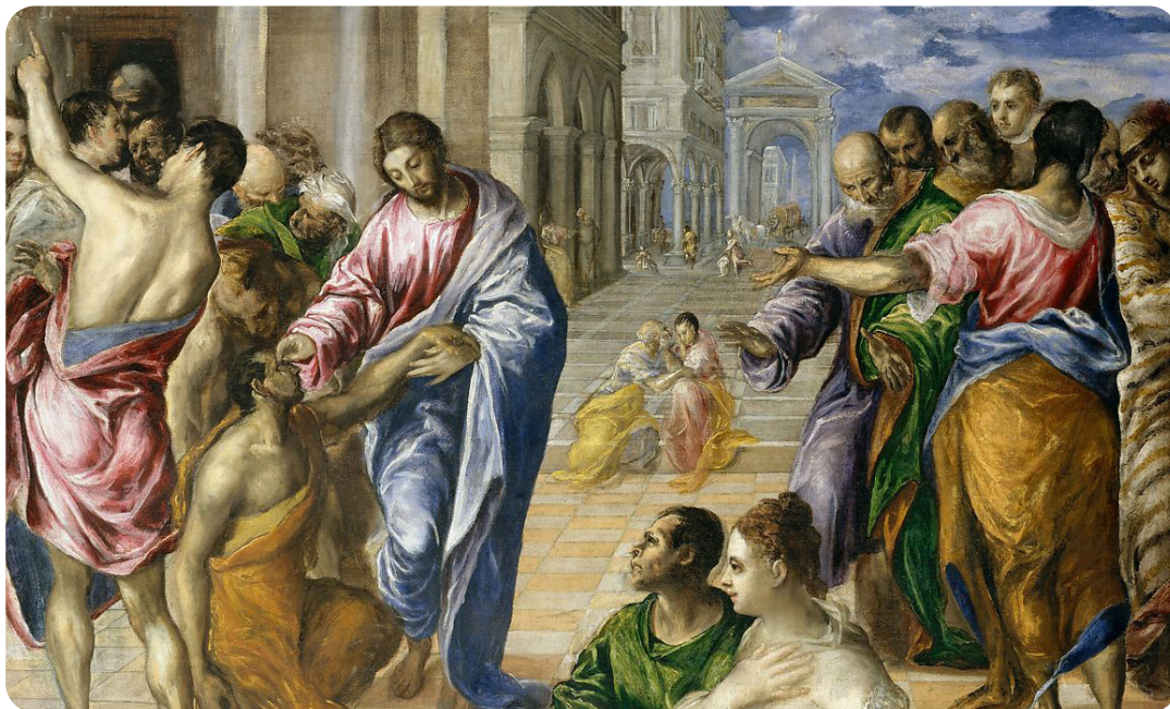
Christ Healing the Blind Man, El Greco, 1560

Accept reasoned answers that draw from the day's learning.