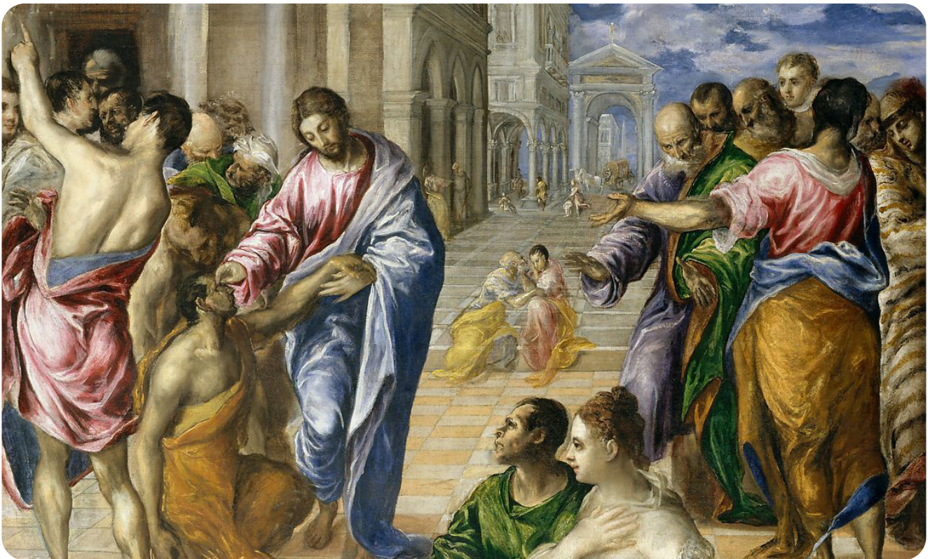
Christ Healing the Blind Man, El Greco, 1560

Recall your class discussion about the Incarnation. What do you think are the most important ways we learn from Jesus that our bodies are good?